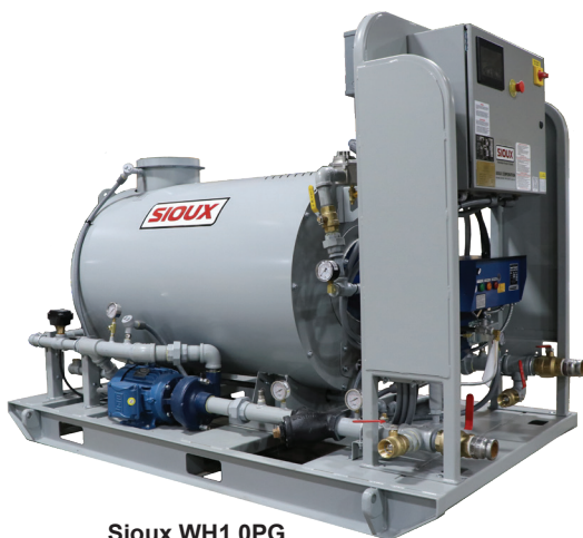
Sioux WH1.0PG • 1,000,000 BTU/HR