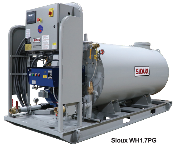
Sioux WH1.7PG • 1,700,000 BTU/HR

Options include stainless steel coils and plumbing, non-pump models, and series flow arrangement. There are units with included water tanks or stand-alone models can be paired with a Sioux tank skid package. Heating coils built to the ASME code section IV and registered with the National Board of boiler and pressure vessel inspectors.